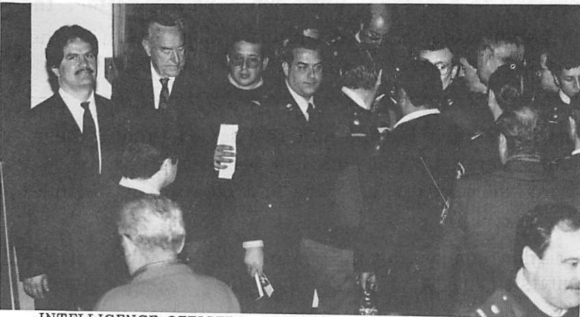
INTELLIGENCE OFFICERS RUSH THE LITERATURE TABLE IN ARGENTINA

accept the theory that the inequality between the rich and poor is comparable to the class struggle as it is taught by Karl Marx. They then join with the Communists in the attempt to overthrow the existing system by armed violence.