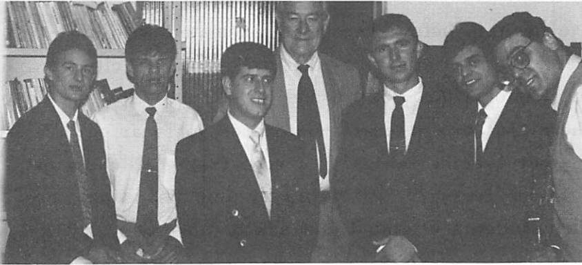
VOLUNTEERS WHO ARE PREPARED TO CARRY THE MESSAGE OF TRUTH AND FREEDOM THROUGHOUT BRAZIL