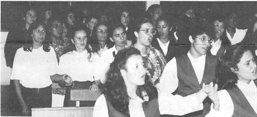
SEGREGATION OF THE SEXES AT THE SEMINAR IN PINDAMONHANJABA--BRAZIL