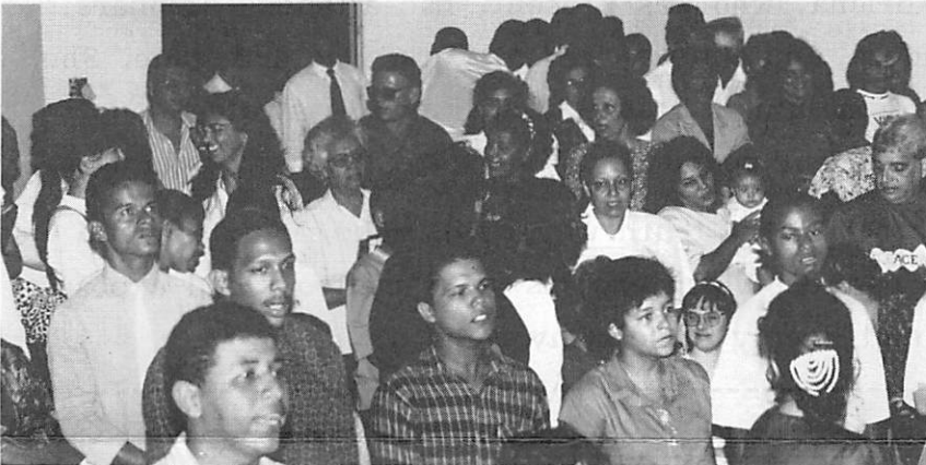
DESEGREGATION AT THE SEMINAR IN RIO DE JANEIRO